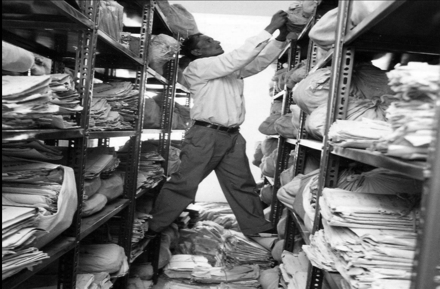
Picture showing a typical example of the paper based storage system used in the Lagos State Land Registry before the development of EDMS