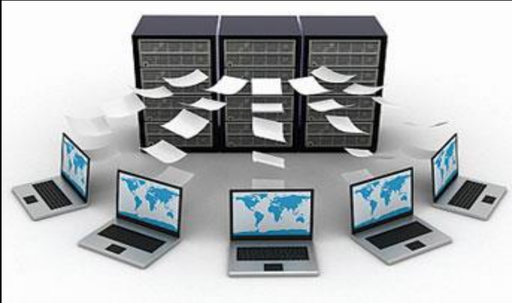
A picture showing the Concept of Electronic Data Management System